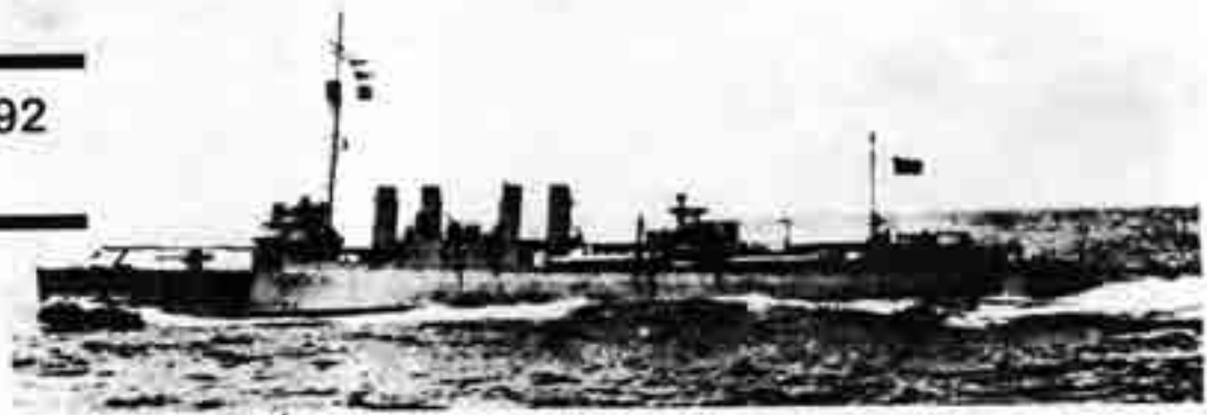
USS REID DD 292 Reunion