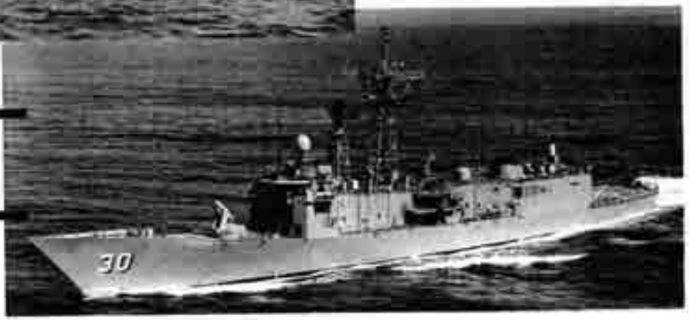
USS REID FFG 30 Reunion