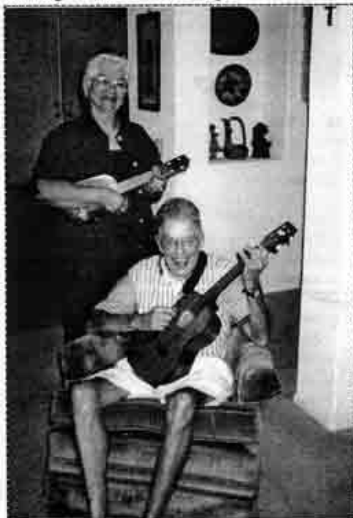
Congratulations on 60 years. Keep strummin'

Wishing you and REID survivors fair winds, following seas and smooth sailing.