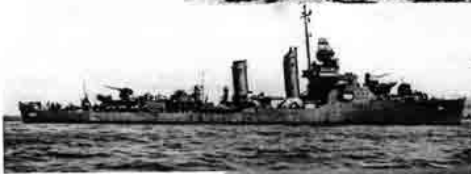
USS REID DD 369 Reunion